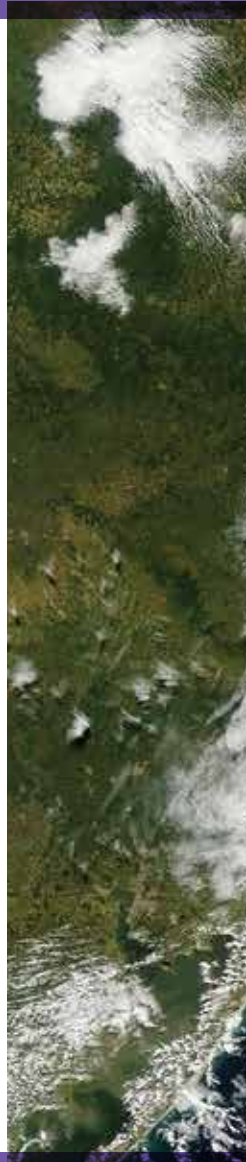
Front Cover Image: Land Atmosphere Near-real time Capability for EOS (LANCE) system operated by the NASA/GSFC Earth Science Data and Information System (ESDIS) with funding provided by NASA/HQ.